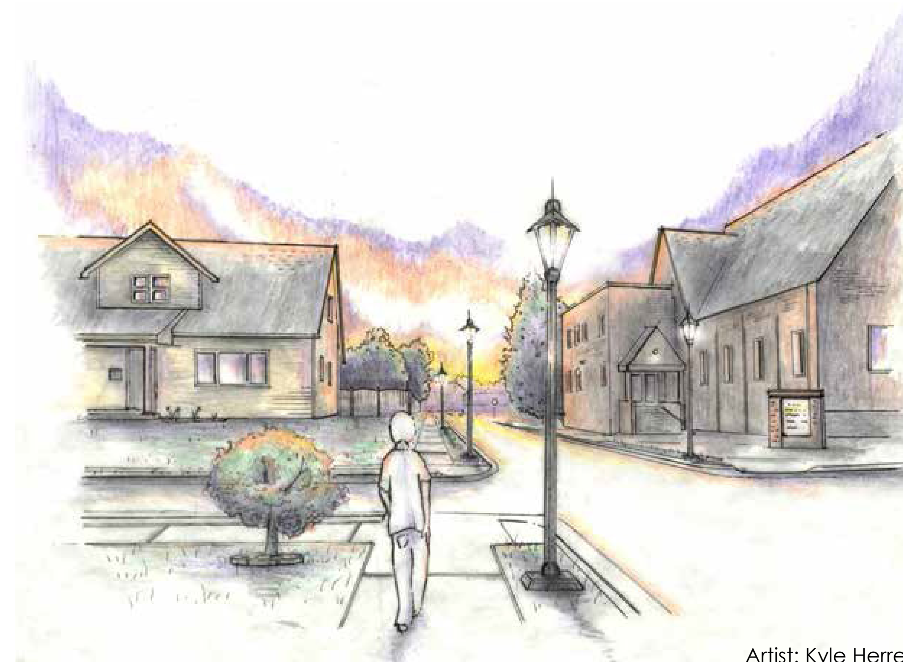
Artist: Kyle Herrera

Improvements to the South Central Neighborhood may eventually ensure a sense of safety and security in south Central. Better street lighting, housing and infrastructure conditions, and access to everyday amenities can help change the neighborhood for the better. Safety education, a proposed neighborhood crime-watch program, and the provision of a local food market are all examples included in the SCNAP.