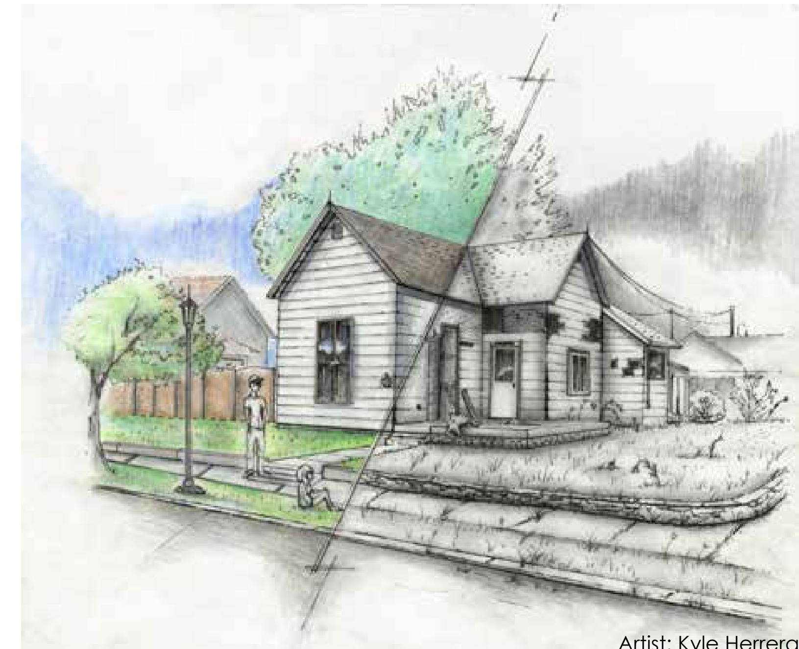
Artist: Kyle Herrera

South Central is focusing on improving its identity as part of its neighborhood action plan implementation. Knowing when you're in the South Central Neighborhood is important. The action plan stresses new and modern developments to improve the overall quality of life, and to make sure residents and their ideas are not just seen and heard, but ultimately realized. The "Identity" initiative in the SCNAP stresses redeveloping the neighborhood to show off some of its best existing characteristics, and the possibility for new developments in the future.