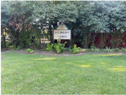
Sign 2020.jpg 1299K