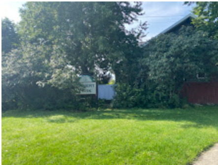
Sign 2023.JPG 4833K