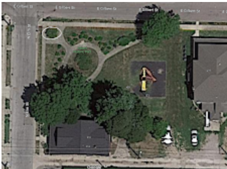
Gilbert Aerial with Sign Suggestion.png 940K